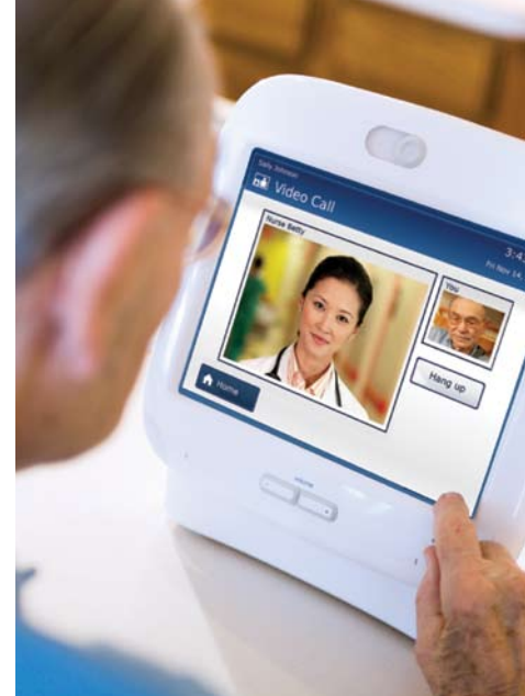
Healthcare professionals can arrange and conduct two-way video calls with patients.

Educational materials, reminders, questions, and units of measure used during a session are presented according to local usage and conventions, as appropriate.